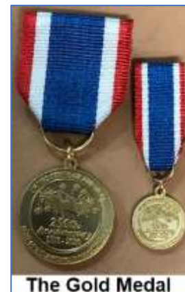
The Gold Medal

The AH Chapter form is available for download at the below link: